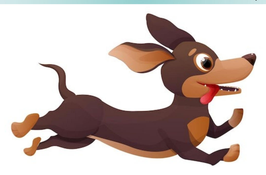
$250 worth of Prizes